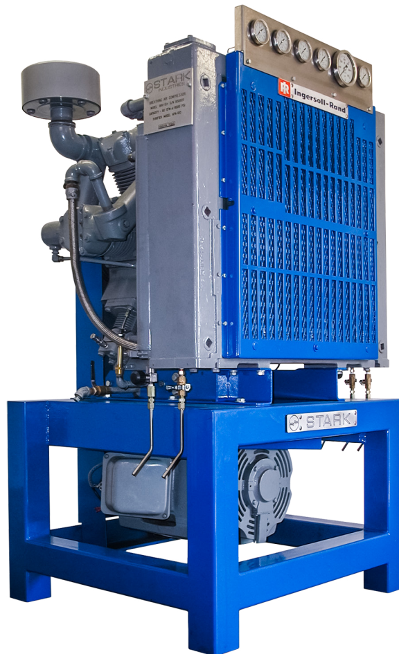
* The model above has manual drain valves.